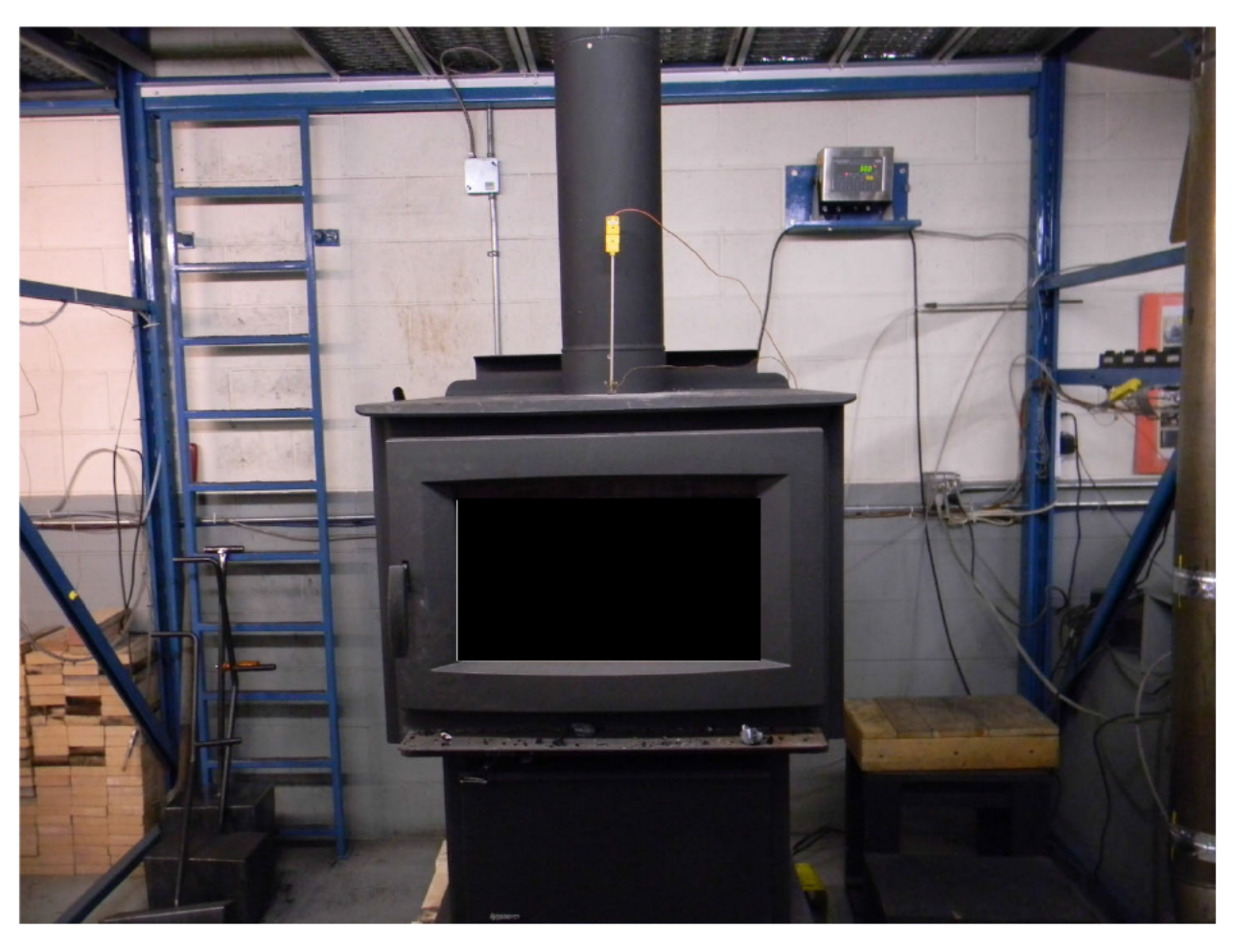
Figure 3: Front